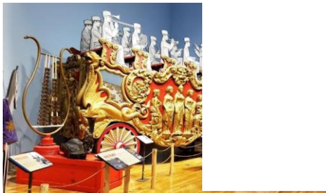
Band wagon from the Ringling Circus Museum